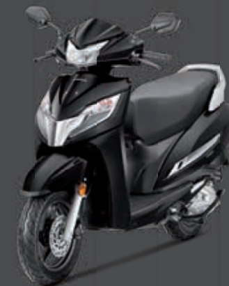
PEARL NIGHT STAR BLACK