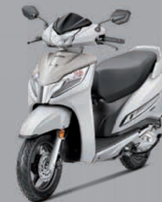
PEARL PRECIOUS WHITE WITH SALEN SILVER METALLIC